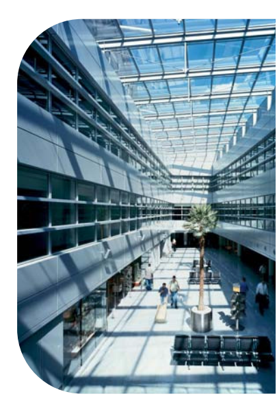
Partition with Pilkington Pyrodur <sup>®</sup> – International Airport, Düsseldorf (D).

Pilkington Fire-resistant Glass is certified for conformity to the applicable harmonised European standards. Third party inspection of the production is part of a comprehensive quality management system to secure consistent toplevel product quality.