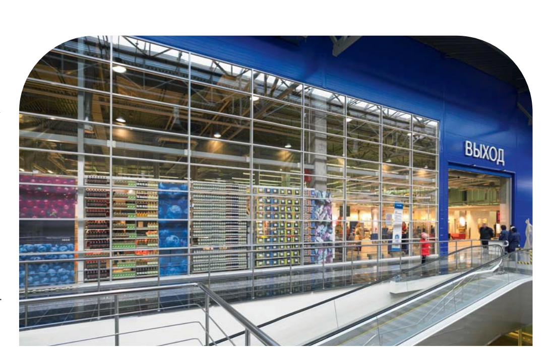
Title page: Façade with Pilkington Pyrostop <sup>®</sup> – Rheinparkmetropole, Colone (DE).