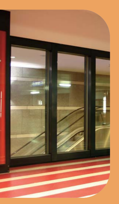
Partition with Pilkington Pyrostop <sup>®</sup> – Shopping Centre, Boulogne (F).